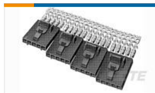
TE Part # 5-103958-9 2X10 MTE RCPT SR LATCH .100CL