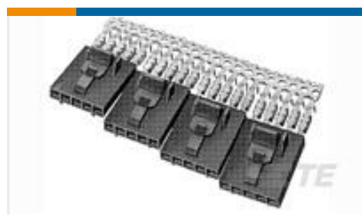
TE Part # 5-103961-9 2X10 MTE RCPT SR LATCH .100CL