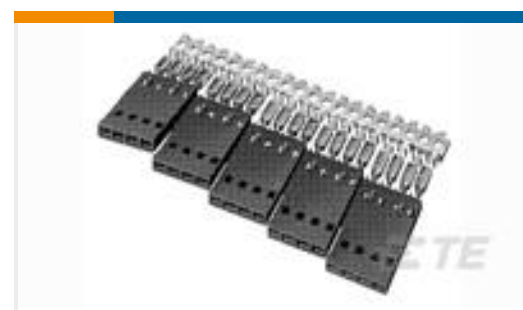
TE Part # 5-103973-9 2X10 MTE RCPT SR RIBBED .100CL